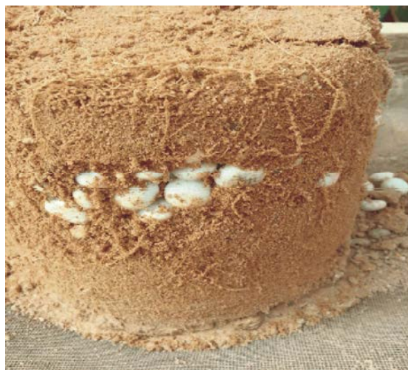
Fig. 2: Beads bed at 10 cm depth

20 cm. The diameters of the plastic pots at the depth of 3, 6, 10 and 13 cm from the top were 18.5, 17.0, 16.0 and 15.0 cm, respectively. A layer of IGB was placed at either 10 or 15 cm depth for both cucumber and tomato seedlings (Figs. 1 and 2). The controls were planted in sand without adding any IGB. The plants were irrigated with 500 ml of water every 3 days. The moisture content of the soil and growth parameters were monitored, measured and evaluated for the control and treatments through measuring plant height during the experiment while dry and fresh weight were measured at the end of the experiment period of 5 weeks. Soil moisture content was measured during and at the end of the experiment using AJ-Moisture meter (Detta-T device, Cambridge, England) with Theta-Probe type ML2X.